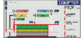
Grinding Size Input