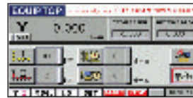
Grinder Condition Input

Delta PLC Digital Control features a 7.2" color touch screen and is equipped with the exclusive EQUIPTOP picture mode working system, easy to learn and operate.